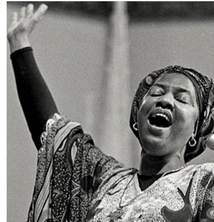
Sister Thea Bowman sings during a 1986 visit to St. Augustine Church in Washington, D.C.

In 1990 the National Black Clergy Caucus designated November as National Black Catholic History Month. Annually this is an opportunity to highlight the heritage, patrimony and witness of Black Catholics.