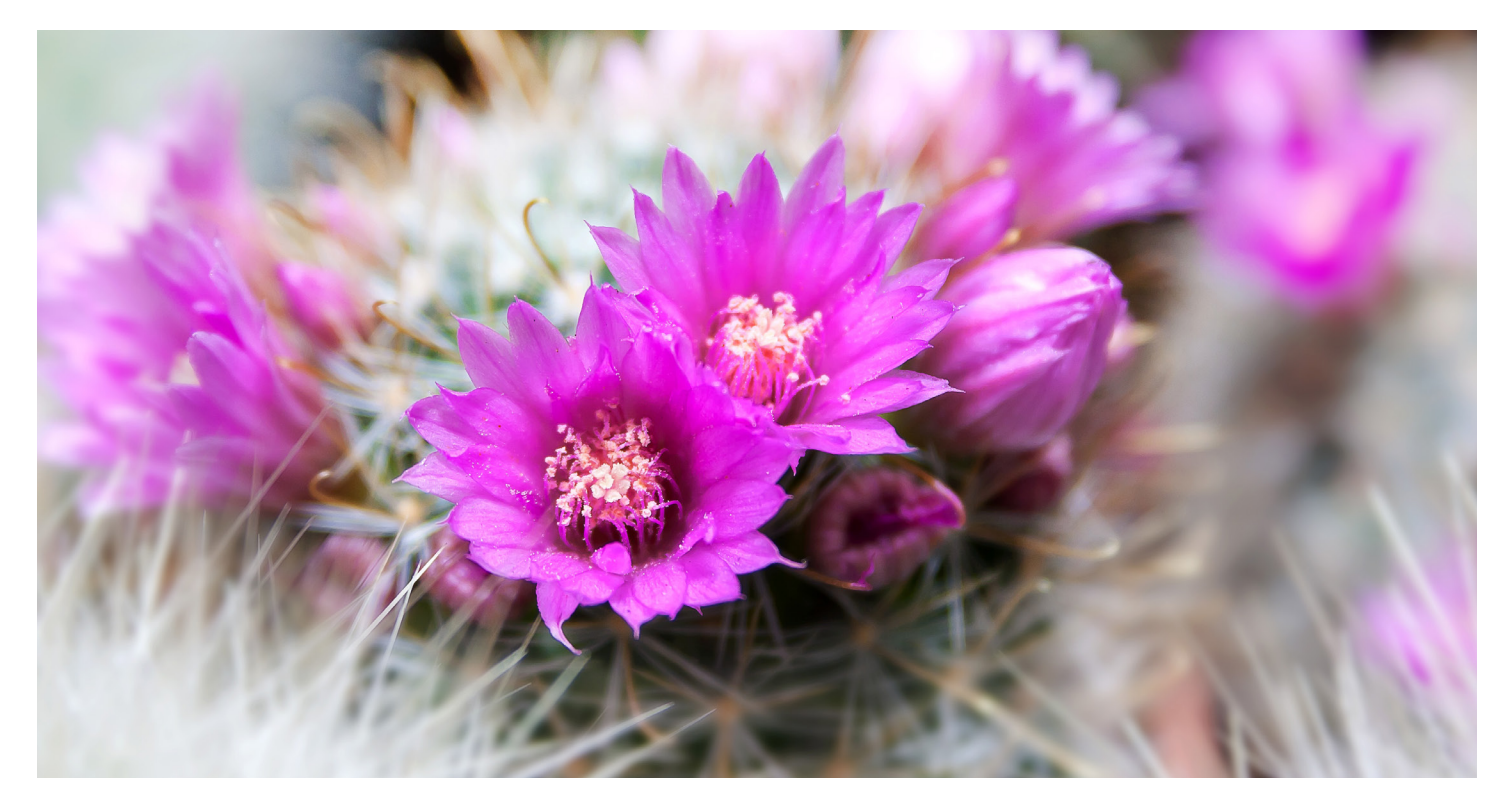
They will see the glory of the Holy One The splendor of our God.