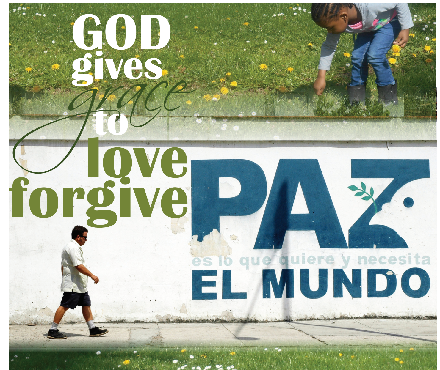
Reflection: Adaire Lassonde, SSND; Design: Joyelle Proot, SSND

Parish Contact Information: 3519 North 14th Street, Saint Louis, MO 63107-3734 Ph: 314.241.9165 www.mhtstl.org