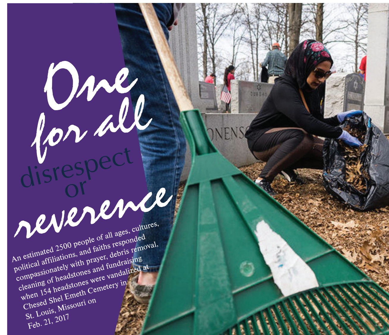
Reflection: Jacqueline Buckley, SSND; Design: Joyelle Proot, SSND; Photo: James Griesedieck courtesy St. Louis Jewish Light