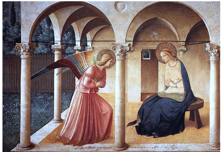
‘The Annunciation’ (1437-46) by Fra Angelico

THURSDAY, MARCH 25, FEAST OF THE ANNUNCIATION: The annunciation is a faith event. Mary’s faith invites God’s entrance into history. This faith event keeps happening, bringing into the ordinariness of life, a message of God’s gracious care for all. We too walk by faith, responding to God’s call daily, with courageous love and compassion to all those we meet.