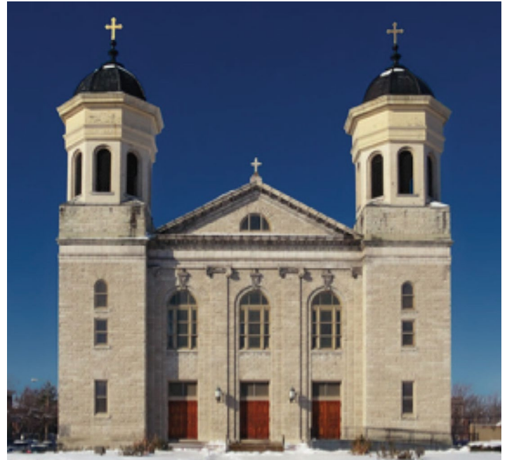
Saints Teresa and Bridget Catholic Church

COLLECTION: 9/10/23 - $6,751.50 THANK YOU.