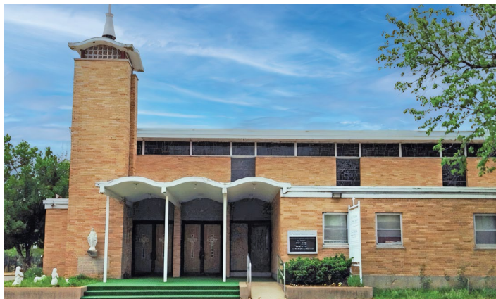
St. Nicholas Catholic Church

In the 1940s Cardinal Ritter, a champion for the cause of equality in education, desegregated the Catholic Schools of the Archdiocese. The parish buildings,