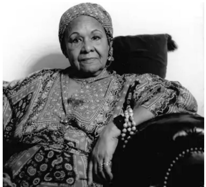
Katherine Dunham in her home in East St. Louis in the 1980s

Dunham was an innovator in African-American modern dance as well as a leader in the field of dance anthropology.